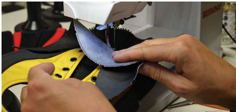
LOCAL MANUFACTURING - A seamstress begins the shoemaking process at SOM Footwear in Montrose. The budding business currently employs a total of seven people.